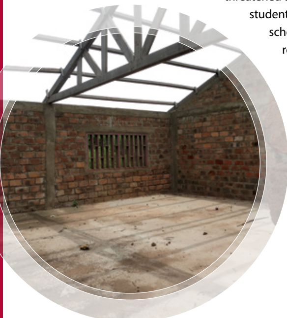
Photo: School looted by an armed group in the Central African Republic over a five-month period. © 2015 Watchlist/Janine Morna.

Since the beginning of the conflict in late 2012, armed groups and international forces have used schools as bases for their activities, contributing to significant damage to school property, exposing students and teachers to risk of attack, and limiting children's right to education.