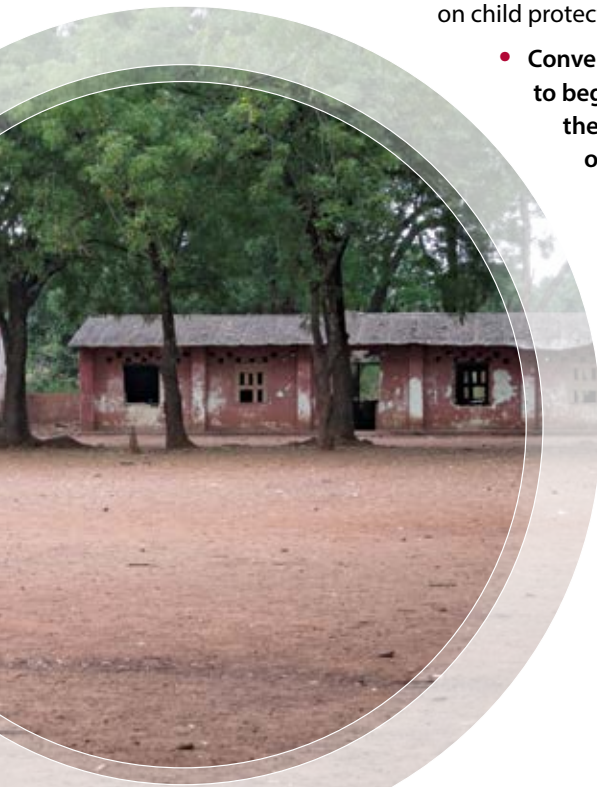
Photo: School in the Central African Republic looted by civilians and possibly armed groups, as well as used by international peacekeeping forces in 2014.